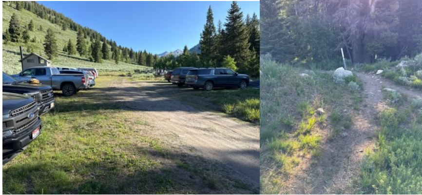
Parking and trailhead