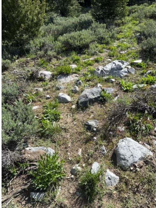
Destination at 4.35 miles