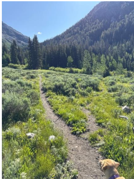
Junction of Hyndman Basin and Big Basin trails (Veer Right)

The Big Basin trail shoots to the right at 2.35 miles. It is clearly the road less traveled. Veer right.