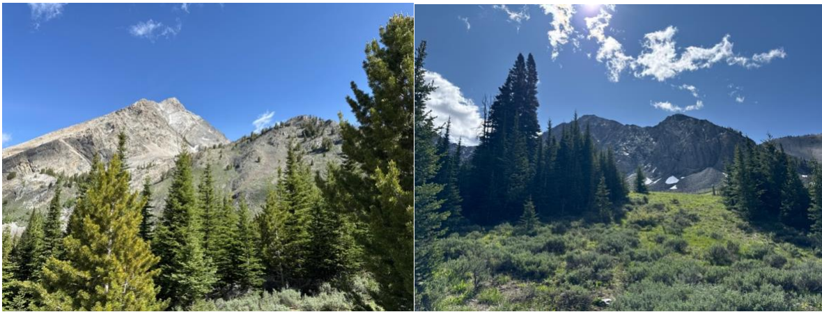
Some of the views from the destination