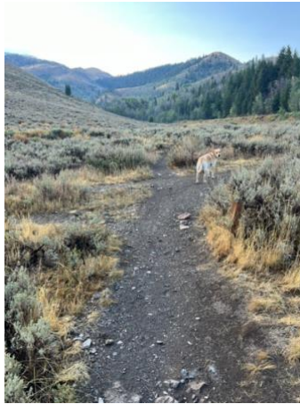
Junction after descent at about .37 miles (Turn Left)

As you wind around the hillside, you will see Trail Creek Cabin to your left. After a short descent, you will come to a junction at .37 miles. The trail to the left takes you to Corral Creek.