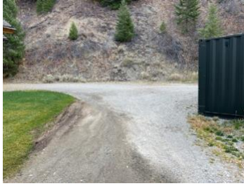
T-junction (Turn Left)

Continue on the path that skirts the backside of Trail Creek Cabin and after a small hill, come to the proper start of the hike at .65 miles. The Aspen Loop trail will veer off to the right through the woods, but continue straight.