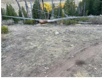
Junction (Turn Left, Go Down Hill)

As you descend the short hill, you will hear Trail Creek flowing from down the slope to your right. As you complete the wide left turn, Bald Mountain will dominate the horizon before you. The trail continues along the right edge of the top level of the meadow and the beautiful Trail Creek comes into view. Just after the 2.13 mile mark, there is a four way junction. If you have a dog, we suggest taking a right turn and heading down the hill towards the creek. At the bottom of the hill, take a hard left turn before the steel bridge to continue along the path. At 2.27 miles, there is an excellent watering hole for dogs.