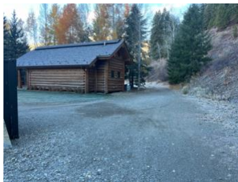
Entrance to Trail Creek Cabin facility (Stay Straight)

The trail descends until it reaches Sun Valley's Trail Creek Cabin facility with a junction coming in from your left at about .53 miles. Trail Creek Cabin is an extremely popular venue for weddings in the spring through fall, so control your dogs as you stay straight and skirt the backside of the property.