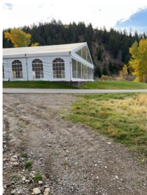
Trail Creek Cabin property (Turn Right)

Follow the main path with Trail Creek flowing on your right. At .18 miles, the path splits. Veer left again. A few steps later, bird dogs may find a few ducks to chase in a pond to the right. At .35 miles, Sun Valley Company's Trail Creek Cabin property will appear before you. It is an extremely popular venue for weddings in the spring through fall, so to avoid crashing the party, it is advised to follow this alternative route on weekend afternoon hikes. It will add only a tenth of a mile but nearly 170 feet climb to the hike.