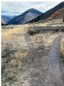
.9 miles (Stay Right)