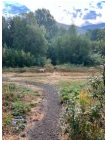
First Junction (Turn Left)

Wind to your right and around the memorial. Go downhill and come to a T-junction with a wide path. Turn left.