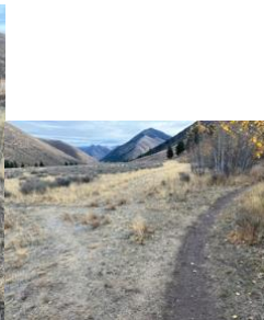
1.3 miles (Stay Right)