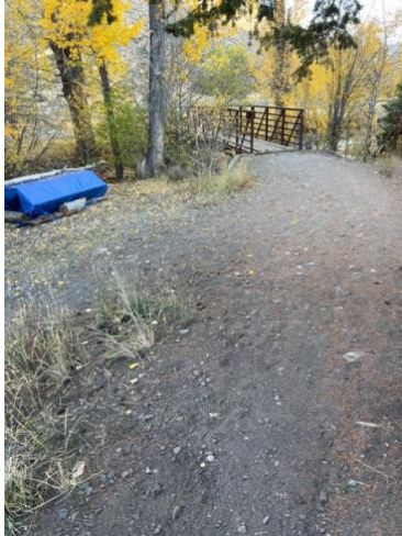
Bottom of hill (Hard Left)