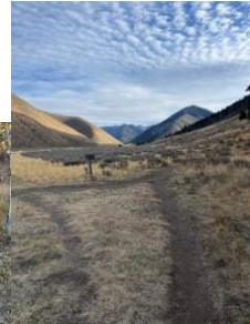
1.47 miles (Stay Right)

The trail rises slightly as you pass a hillside and at 1.75 miles, you will enter a stand of tall, fire-damaged trees. Quickly arrive at a junction. The path straight ahead continues into the forest for a number of miles to Corral Creek Road, but is mainly used by mountain bikers. Instead of following that, turn left and be careful with your footing as you scurry down a rocky hill.