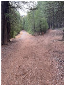
First junction with Aspen Loop (Stay Straight)

Continue on the path that skirts the backside of Trail Creek Cabin and after a small hill, come to the proper start of the hike at .65 miles. The Aspen Loop trail will veer off to the right through the woods, but continue straight.