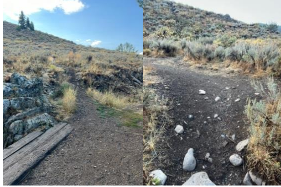
Third Junction (Turn Left) Fourth Junction (Turn Left)

As you wind around the hillside, you will see Trail Creek Cabin to your left. After a short descent, you will come to a junction at .37 miles. The trail to the left takes you to Corral Creek.