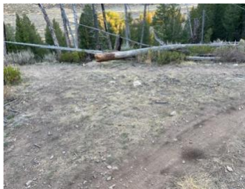
Junction (Turn Left)

The trail rises slightly as you pass a hillside and at 1.7 miles, you will enter a stand of tall, fire-damaged trees. Quickly arrive at a junction. The path straight ahead continues into the forest for a number of miles to Corral Creek Road, but is mainly used by mountain bikers. Instead of following that, turn left and be careful with your footing as you scurry down a rocky hill.