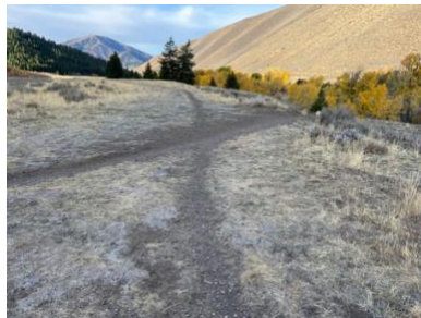
2.05 miles (Turn Right)

As you descend the short hill, you will hear Trail Creek flowing from down the slope to your right. As you complete the wide left turn, Bald Mountain will dominate the horizon before you. The trail continues along the right edge of the top level of the meadow and eventually the beautiful Trail Creek comes into view. Just after the 2-mile mark, there is a four-way junction. If you have a dog, we suggest taking a right turn and heading down the hill towards the creek. At the bottom of the hill, take a hard left turn to continue along the path. At 2.2 miles, there is an excellent watering hole for dogs.