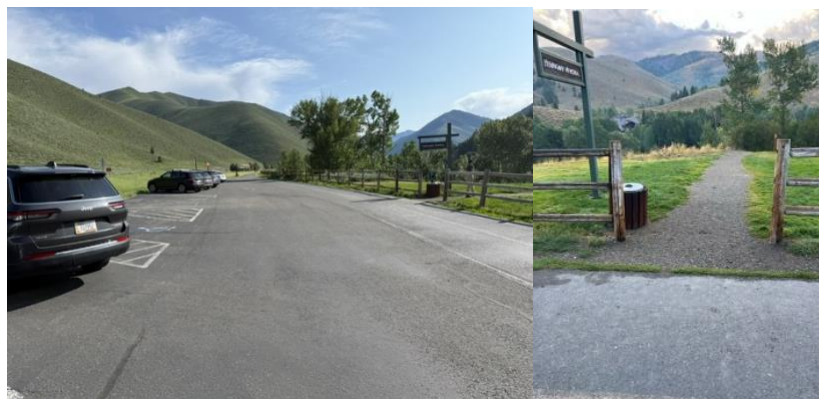
Parking and Trailhead

There are no bathroom facilities at the trailhead.