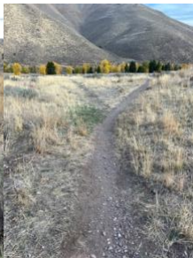
1.05 mile (Stay Right).