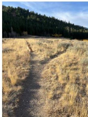
2.7 miles (Stay Right)

Climb the short hill at 2.3 miles to re-connect to the original trail. Come to a junction at 2.7 miles and stay right.