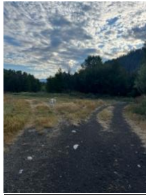
Second Junction (Veer Right)

Follow the main path with Trail Creek flowing on your right. At .18 miles, the path splits. Veer right and cross a bridge over the creek.