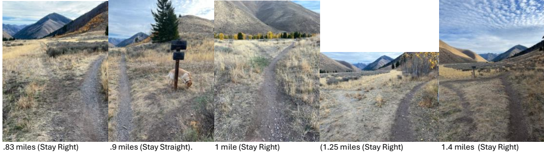
.83 miles (Stay Right)