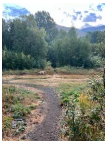
First Junction (Turn Left)

Wind to your right and around the memorial. Go downhill and come to a T-junction with a wide path. Turn left.