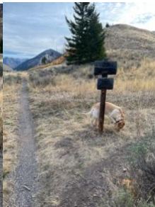
.97 miles (Stay Straight)