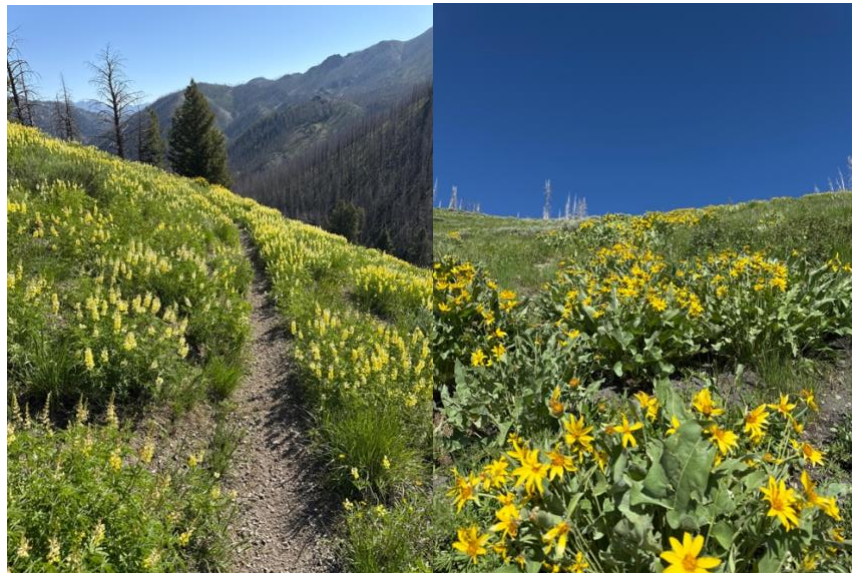
Wildflowers (Not quite at their peak)

At about .35 miles, cross a bridge spanning a small ravine and continue to pass through the blackened forest. Shortly before reaching the mile mark, you exit the tree line and enter a hillside meadow exposed to the sun. In mid-summer, this area is covered in buckwheat, lupine and other wildflowers.