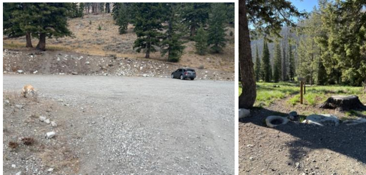
Parking and Trailhead