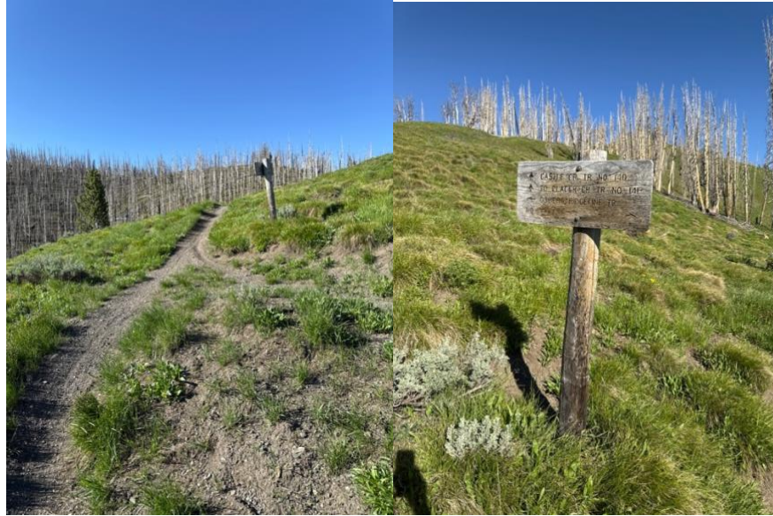
Junction with Castle Creek trail (Turn Right)

The trail cuts through the middle of an open hillside before leveling out as it reaches another section of the fire-damaged forest at about 1.65 miles. The trail then pleasantly rolls over the next half mile or so and beautiful views of the Smoky Mountains open before you.