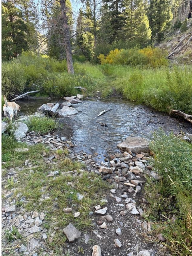
Creek crossing at .15 miles

At .6 miles, come to the first of two short rocky sections of trail. Hiking poles will come in handy for hikers who struggle with their footing.