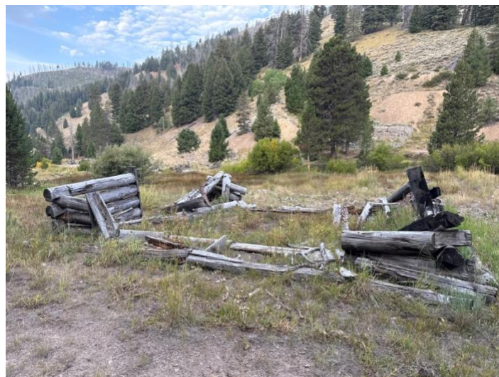
Mining ruins at 1.15 miles

There is an easy water crossing just before the mile mark and the trail briefly enters the woods before entering another large meadow which features a few old mining structures.