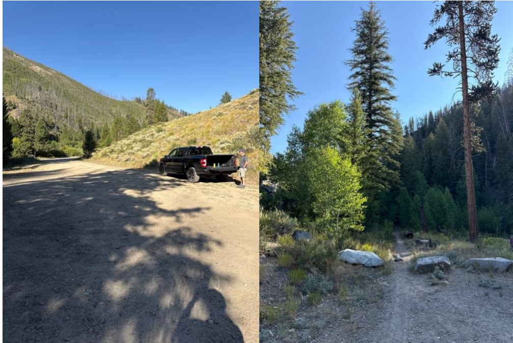
Parking and trailhead